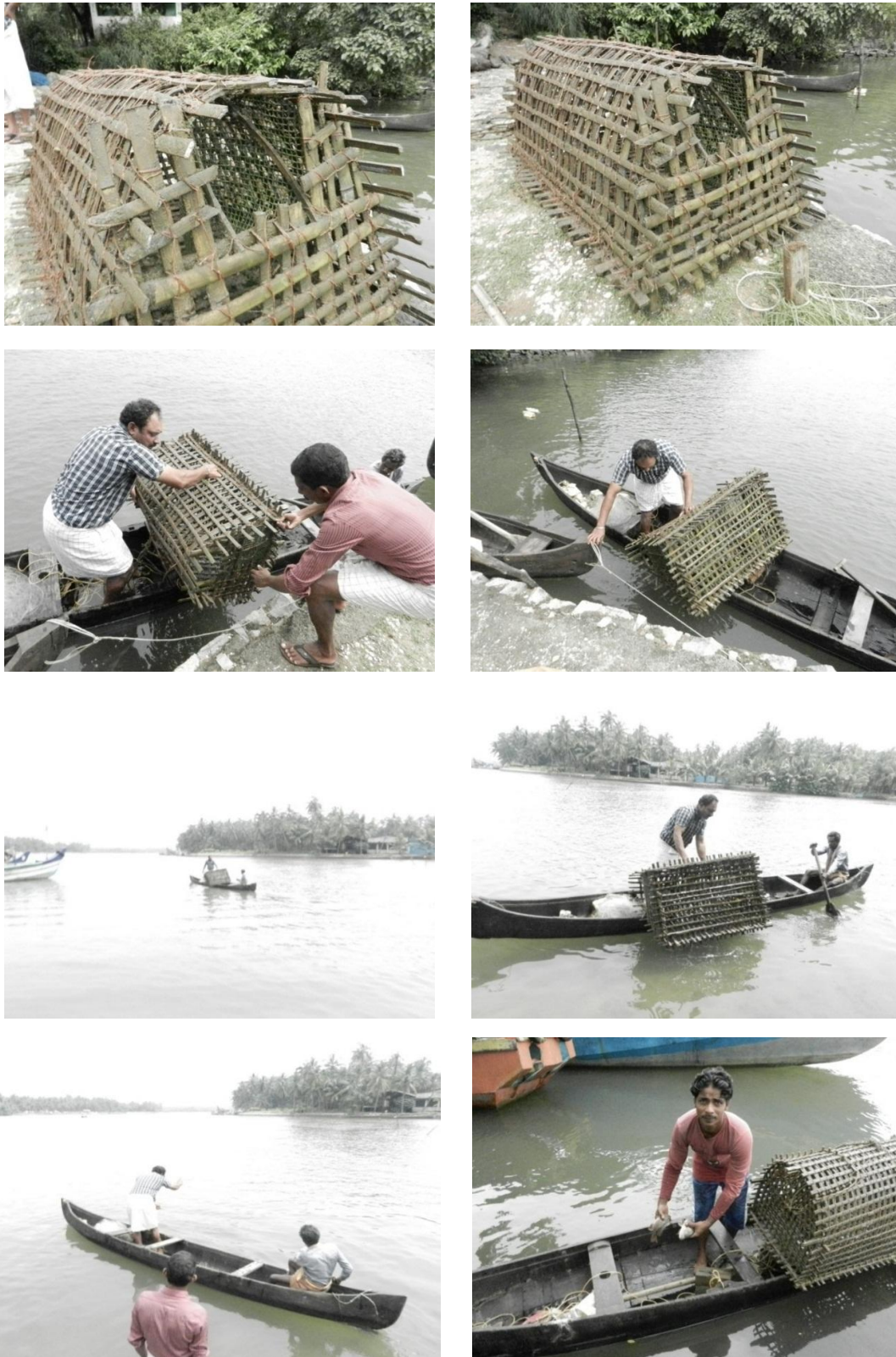
Fig. 1. The structure of “ChemballiKoodu” (Box Trap)