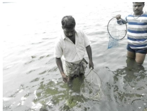
Fig. 2. Komma in operation