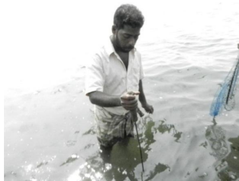
Fig. 3. Use of crab piercer by fishermen