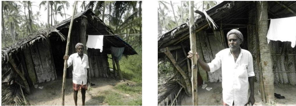
Fig. 4. A fisherman with a "Challam"